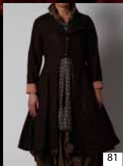
66148. WOOL. DELIVERY 3.