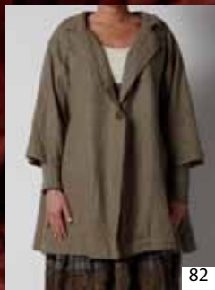
66149. WOOL. DELIVERY 3.