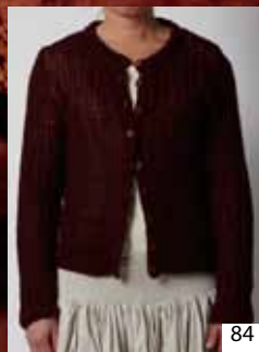
44325. WOOL KNIT. DELIVERY 3.