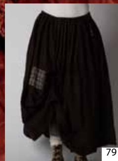
22663. WOOL. DELIVERY 3.