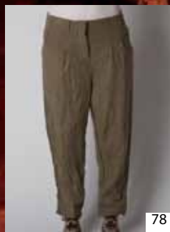
11161. WOOL. DELIVERY 3.