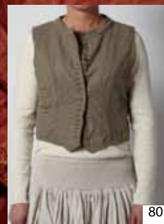
33137. WOOL. DELIVERY 3.