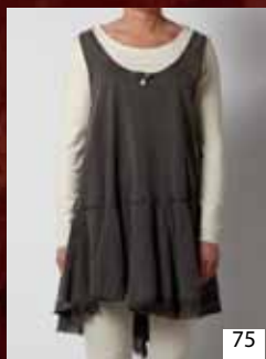
55298. JERSEY WASH. DELIVERY 3.