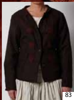
66150. WOOL. DELIVERY 3.