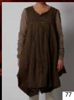
55282. TWILL. DELIVERY 3.