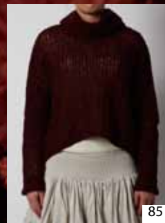
44326. WOOL KNIT. DELIVERY 3.