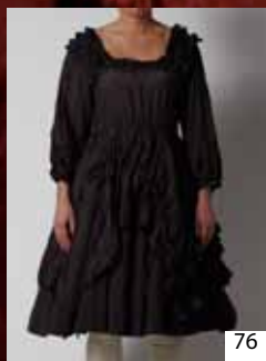
55290. SILK. DELIVERY 3.