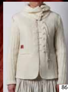
44327. WOOL KNIT. DELIVERY 3.